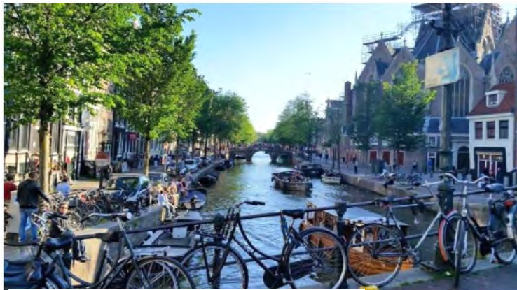
Canals of Amsterdam, Netherlands