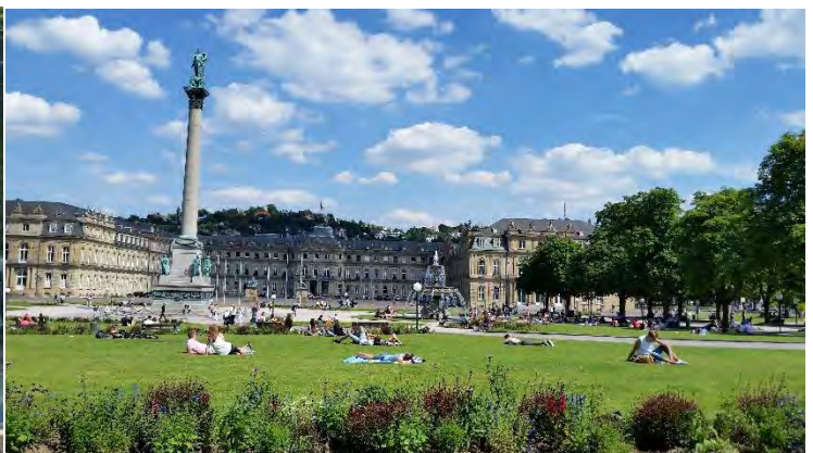
Schlossplatz Stuttgart, Germany