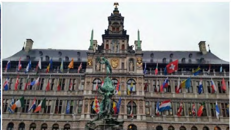
Town Hall Antwerp, Belgium